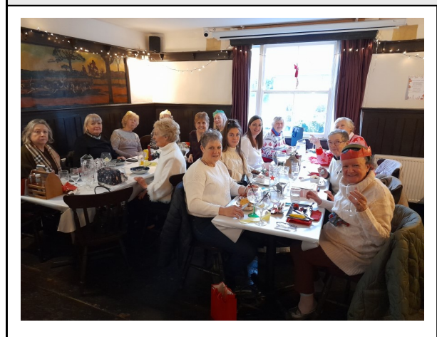
The Great Warley Ladies lunch club Christmas dinner at the Thatchers proved to be very popular!