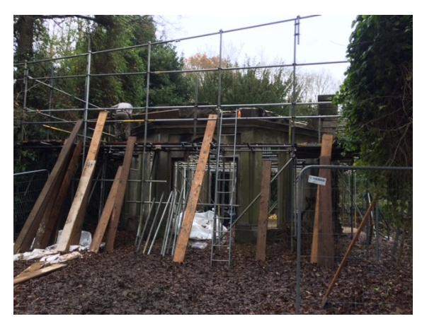
Scaffolding removal at Warley Place