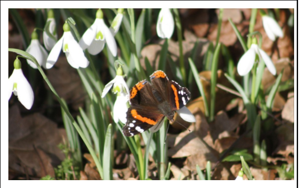
at Warley Place on 26 January which is very early in the year for a Red Admiral