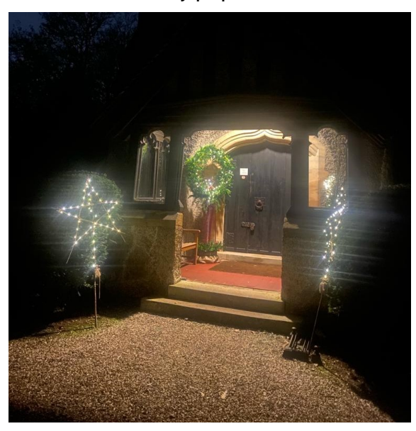
Beautiful Christmas Flowers at St. Mary's