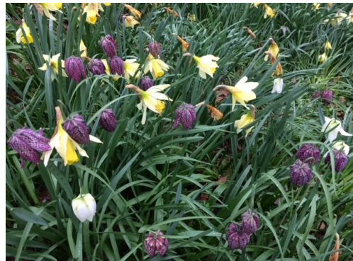
Snakes Head fritillaries among the daffodils under the Caucasian Wingnut tree