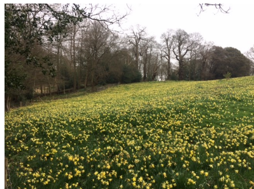
Daffodils in the west meadow