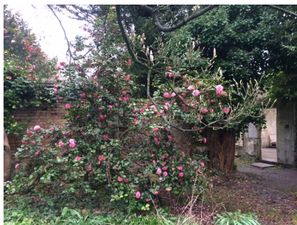
Miss Willmott's camellia flower- ing in the walled garden