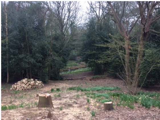
View from the Terrace to the boating lake

The reserve is still open for people to visit as pedestrians on their own, subject to any further restrictions because of the coronavirus. There will be plenty more flora and fauna to enjoy, with the bluebells sure to be making a spectacular show in a few weeks time.