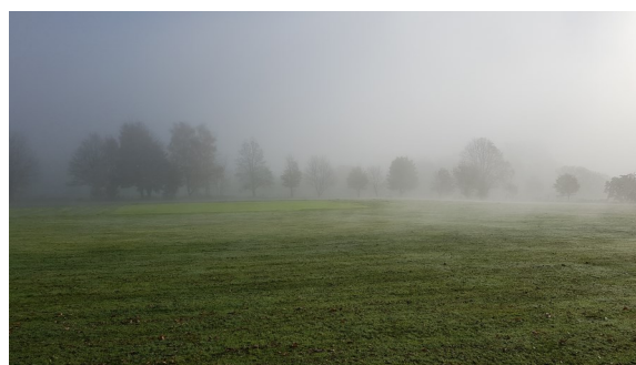
Early morning autumn fog clearing at the cricket ground