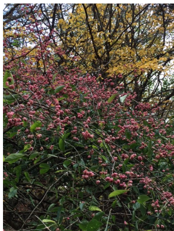
Pink spindle berries by the Persian ironwood tree at Warley Place.