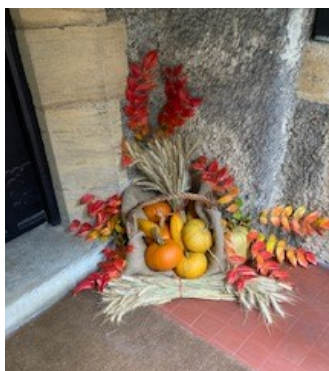
Harvest Festival floral arrangements at St Mary's October 2020