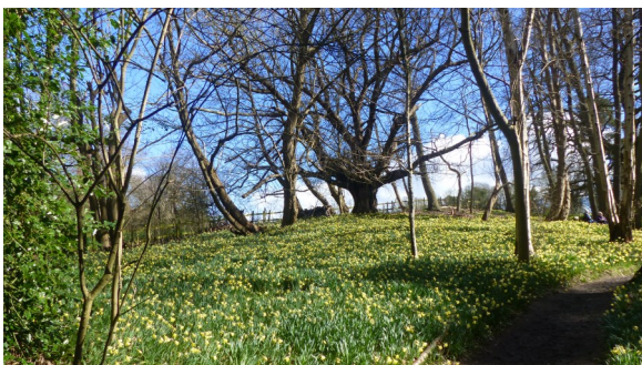
The glorious annual daffodil display at Warley Place which remains open to visitors