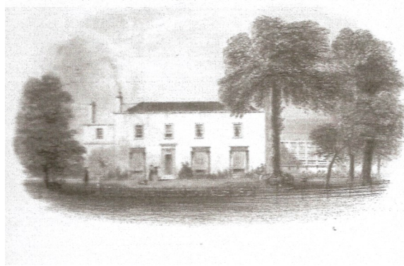
The old Great Warley Rectory

After a time, the old rectory became a country club for gentlemen. When it was finally demolished, its grounds became an industrial estate, with the A127 running beside it. The site is now owned by PERI.