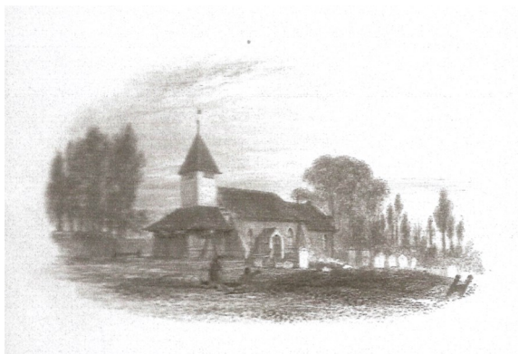
The old Great Warley Church