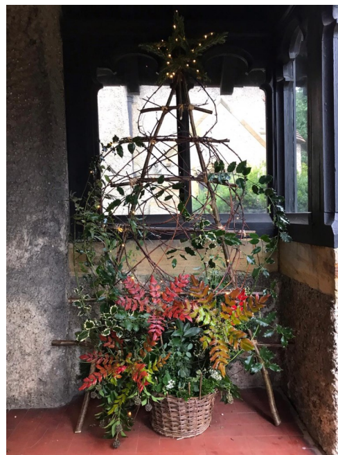
One of the fabulous Flower arrangements at St. Mary's over Christmas