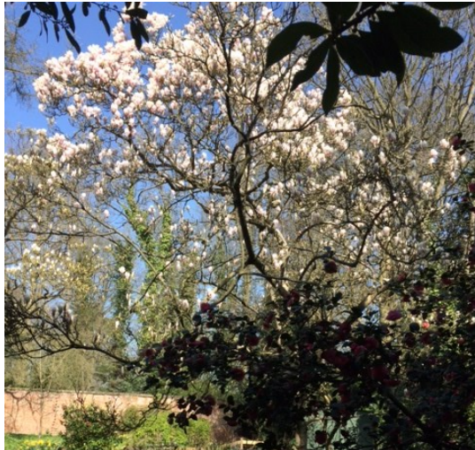
Magnolia in the walled garden