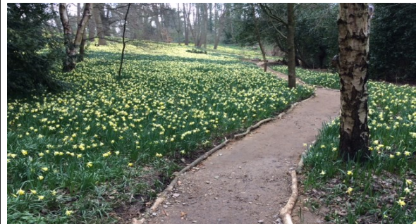
The new Nut Walk