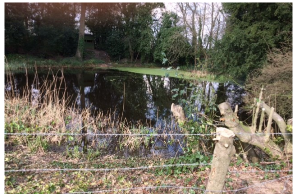
Newly cleared South Pond