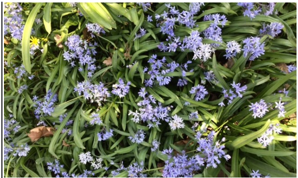
Scillas by the main drive