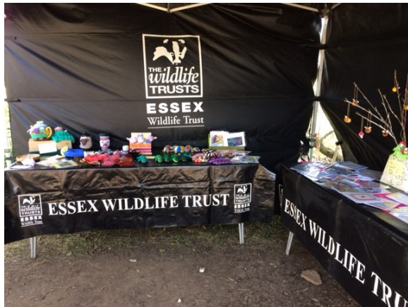
The gazebo and sales tables