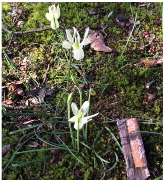
Angel's Tears under the Spanish Chestnuts