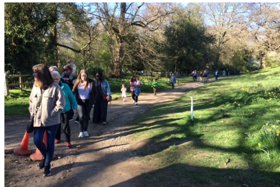
Mother's Day visitors at Warley Place