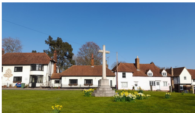
The War Memorial in Great Warley