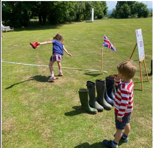
Youngsters enjoying welly throwing at the Jubilee picnic