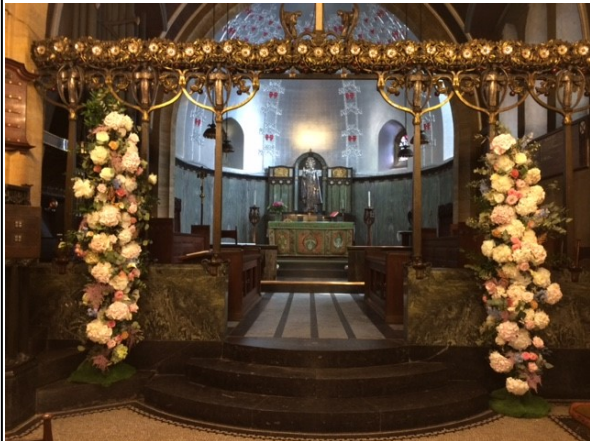
Beautiful flowers at the recent wedding at St Mary's