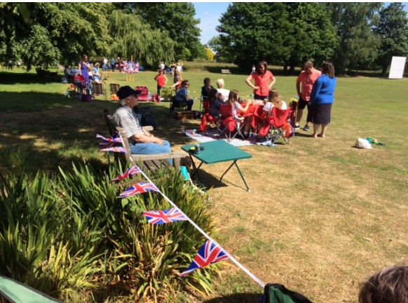
Photos from the recent village Jubilee picnic