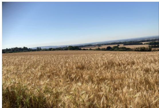
Last Harvest at Hole Farm, Great Warley