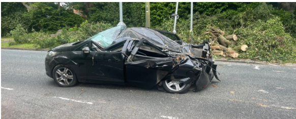
Car crushed by a falling tree