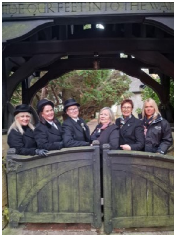
The ladies from Bennett's Funeral Directors at the Lychgate at St. Mary's, Great Warley on International Women's Day