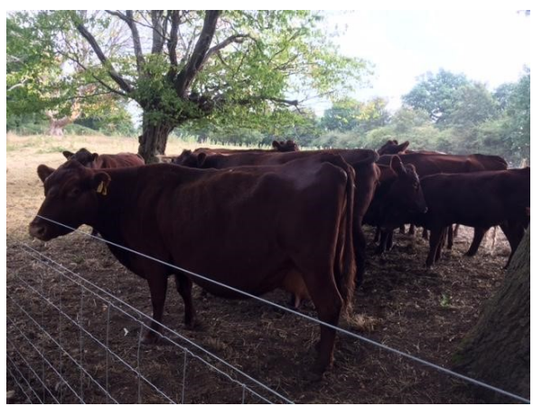
Red Poll Cattle at Warley Place