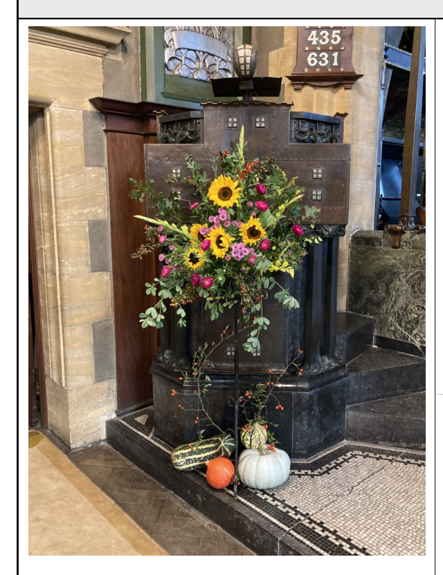
Harvest Festival flowers at St Mary's